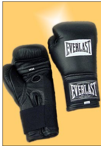
Ensemble Business Software delivers a knock out solution including apparel industry specific features for eBusiness applications.

Every morning Horowitz receives updated reports showing him the number of Web orders from the previous day, the number of new customers, and the top selling items. Internet retail customers are assigned a uniquely formatted customer identifier, making it simple to categorize this type of customer in the database. This dynamic and current data helps the company stay right atop color and style trends, as well as geographic preferences, data which is then translated into production and distribution decisions.